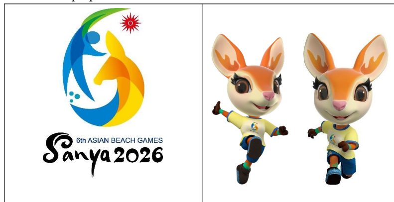
The 6th Asian Beach Games

The OCA owns all intellectual property rights of Sanya 2026, including the official emblem and mascot (as provided below). NOCs may use these rights solely for sports or news coverage purposes, and must not associate these rights with their sponsors or use the rights for any other commercial purposes.